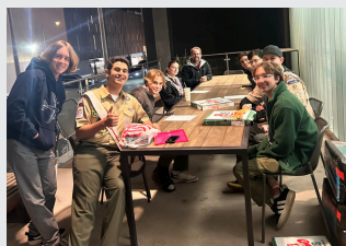
Heyoka Chapter Meeting on 3/12/25

The Heyoka Chapter has had a very successful February. We have had great attendance at scouting events. Whether that's at our District Dinner, Lodge events or Unit Elections we have been serving our scouting community. Our chapter is also playing a large part in planning and serving at the Crescent Bay District Camporee as well as the accompanying Webelo-Ree. The Heyoka Chapter looks forward to more Unit Elections, visitations, and the service we will be doing in the following months.