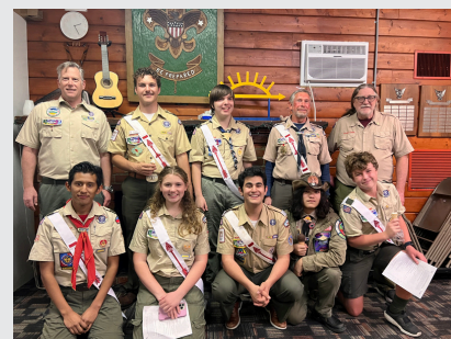
Xaxaamonga Chapter Meeting on 2/27/25

Thank you to everyone who has been a part of this positive change! We look forward to seeing you at our next event!